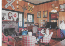
RELAXING IN THE DEPOT - Some guests relaxed and visited while others examined all of the items on display in the depot. The depot is located in the heart of San Augustine, Texas.